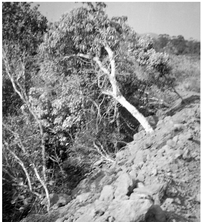
An un-reclaimed pit and waste rock dump belonging to Vedanta just above farm land in the Kolli Hills, Tamil Nadu