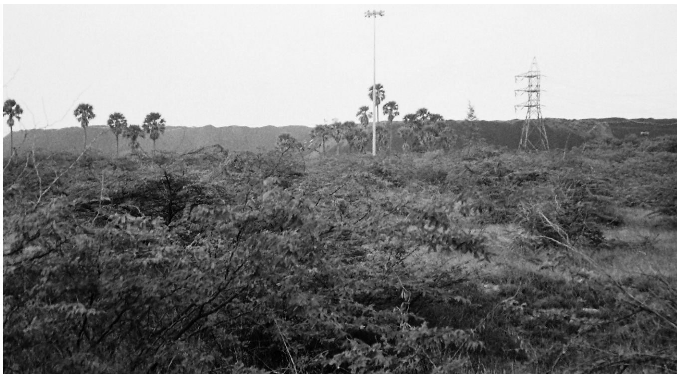
Thousands of tonnes of arsenic-laden slag, open to the wind, visible behind scrubland at the Tuticorin smelter (April 2005).

From: Show Cause Notice to Sterlite Industries, Tuticorin, April 2005