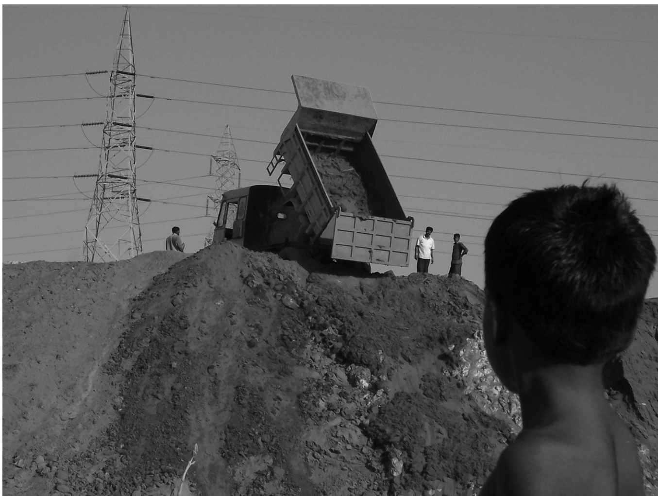
A child observing red mud being dumped near the Stanley Reservoir, at Mettur.