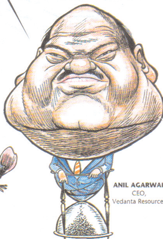
ANIL AGARWAL CEO, Vedanta Resources