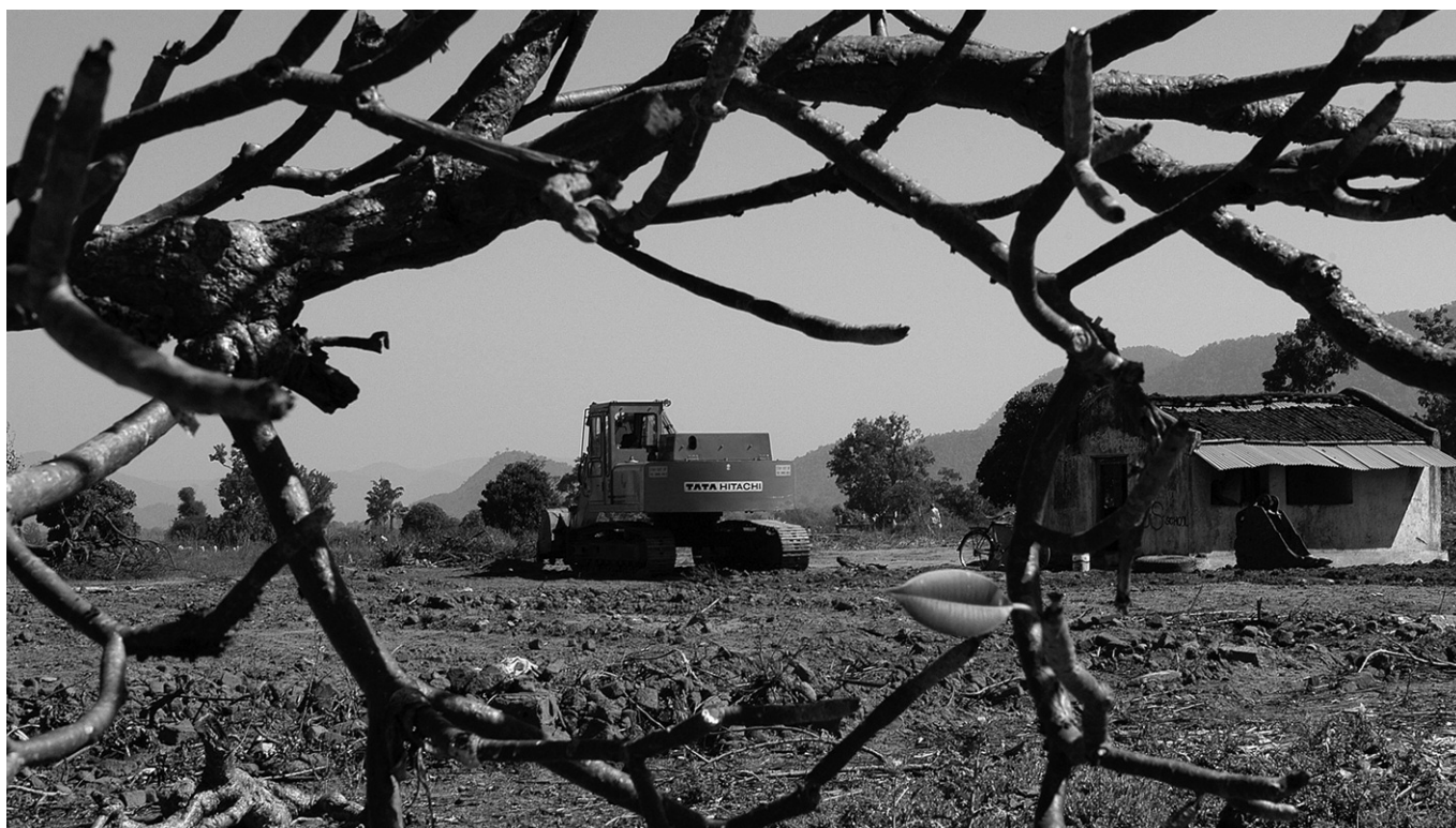
Not so long ago there were people in Kinari. Now it is part of Vedanta's Lanjigarh refinery

As confirmed in a July 2005 study by The Environment Protection Group Orissa (EPGO), the entire Nyamgiri deposit lies atop of a protected forest area which is home to a variety of rare and threatened fauna and flora. Their diversity is scarcely equaled in the rest of south Asia and includes thirty medicinal plants, at least fifteen kinds of epiphytic orchid, twenty wild ornamental plants, more than ten kinds of wild relatives of crop plants (including some protected under an international undertaking), tigers, leopards, elephants, sloth bears, palm civet, and other animals, many of which are listed as endangered by the International Union for the Conservation of Nature (IUCN). There are also rare birds, the unique Golden Gecko lizard and wild snakes including a rare type of viper.*