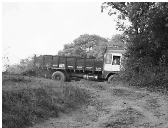
A Vedanta truck leaves the Balmadies coffee plantation, uncovered and spraying silica-laden bauxite dust on children returning from school.

Exasperated by these procrastinations and Vedanta's illegal actions, in late July 2005 the SCMC drafted an order to shut down the smelter for "fully violating the Hazardous Waste Rules 1989 and the order of the Apex court dated 14-10-2003 and the consent of the Tamil Nadu Pollution Control Board (TNPCB)."