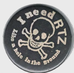
Slogan on a badge that Partizans used back in the 1970s

The phosphate rock reserves are finite – once they are gone they are gone – and New Zealand should not be playing any part in the further depletion of stolen resources.